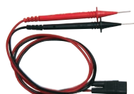
Includes TEST LEAD 9208 and CARRYING CASE 9398