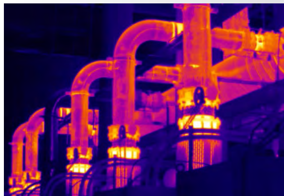
MultiSharp Focus, available on the RSE300 and RSE600 Infrared Cameras