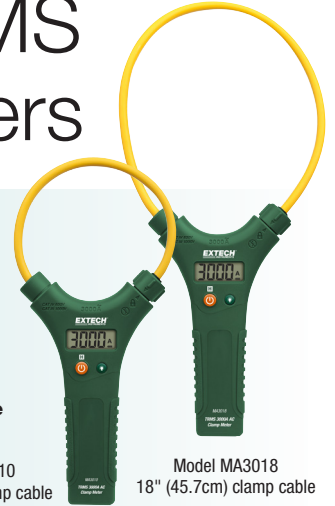
Model MA3018 18" (45.7cm) clamp cable