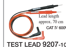
TEST LEAD 9207-10