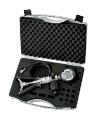
Basic version incl. pneumatic pressure generation

Available measuring ranges see specifications