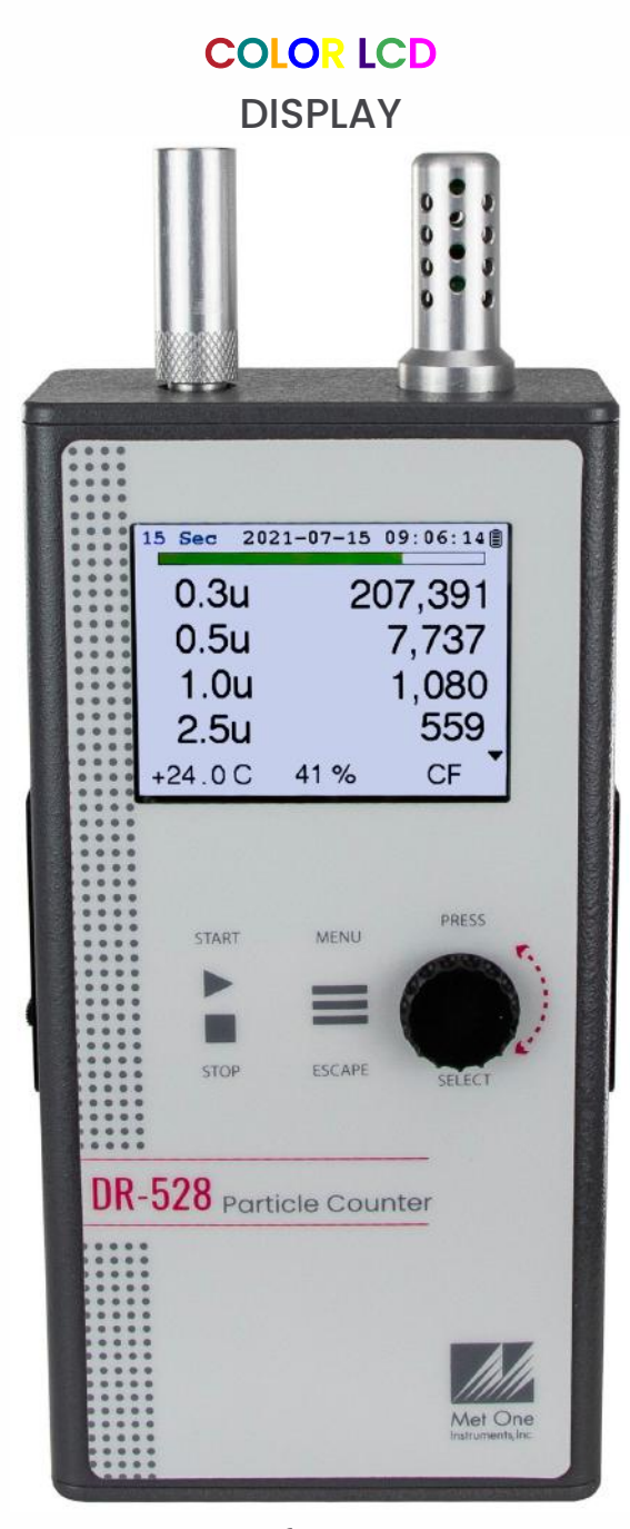
New Interface Features Numeric Sample Countdown Timer