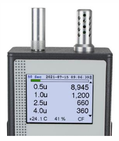
Scrolling Functionality Streamlines Sampling