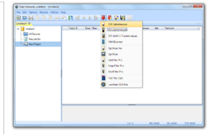
New versions of LinkWare are always backwards compatible with previous versions, so you can stay current and always integrate tests from different testers into 1 test report.