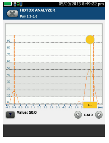
High Definition Time Domain Cross talk (HTDTX) shows the far end connection is clearly the issue

Shield continuity historically is a direct current- DC measurement -with no distance to fault available. The DSX CableAnalyzer is the first field tester to report distance to shield integrity issues using a patented A.C. measurement technique. This is especially important in datacenters. Other testers will show the shield connected even when it isn't, because the racks in a datacenter are common grounded. Other testers may tell you there is a break in a shield, but not pinpoint the exact location giving no indication of where to start rework.