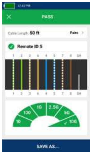
Cable test with remote attached shows remote ID number 5, length and pairing of each wire and cable performance of up to 10 Gb/s.