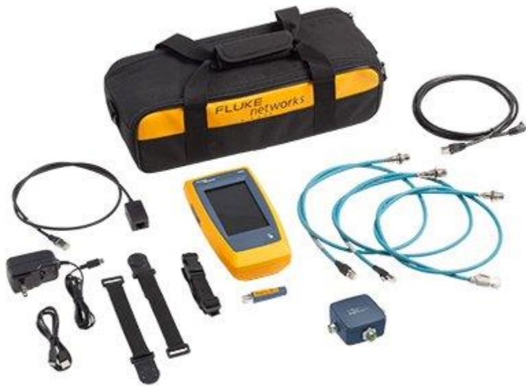
LinkIQ-IE (LIQ-100-IE) with accessories including M8, M12 D and M12 X adapter cables.