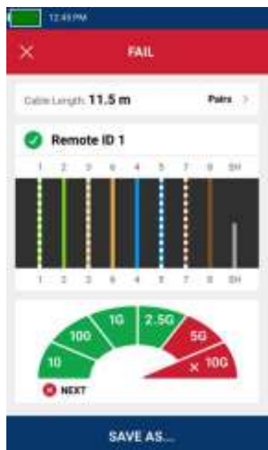
Cable test with remote attached shows remote ID number 1, length and pairing of each wire and cable performance of up to 2.5 Gb/s but failed the test due to a user-set limit of 10 Gb/s performance.