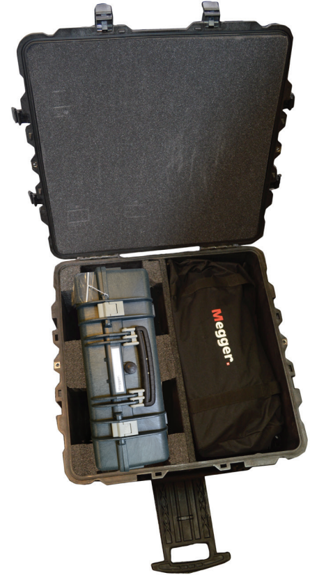
Transit Case Cat # 2005-340 Dimensions: 27 x 27 x 16 in. (69 x 69 x 41 cm) Weight: 37 lb (17 kg)