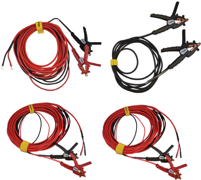
Lead set, 60 ft (18 m) [ 500 kV]. Also available in 30 ft (9 m) and 100 ft (30 m) Cat # 1004-641