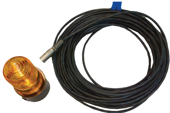
HV Strobe and Leads Cat # 1004-639 Length: 60 ft ( 18 m) Weight: 2.3 lb (1.1 kg)