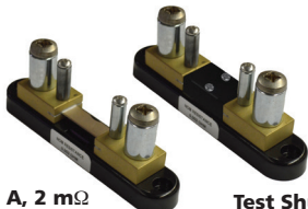
Test Shunt, 50 A, 2 mΩ Cat # 1006-512-1