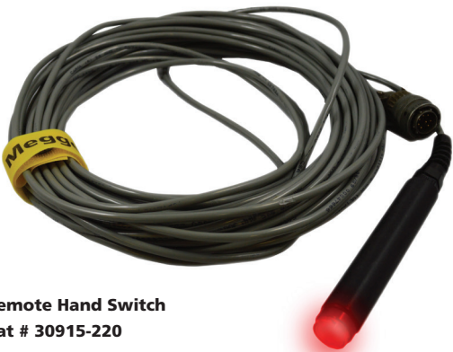
Remote Hand Switch Cat # 30915-220