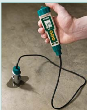
Extension cable and weight attached to meter and electrode module for easy measurement on concrete