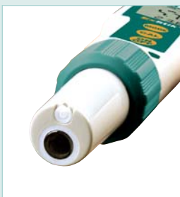
Flat Surface Electrode with rugged construction works in liquids, semi-solids and solids.