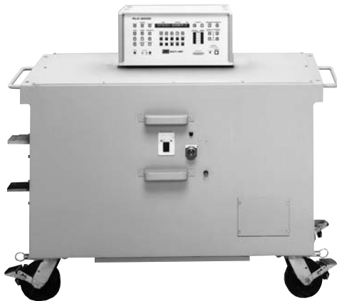
Model PS-9160 Universal Circuit Breaker Test Set