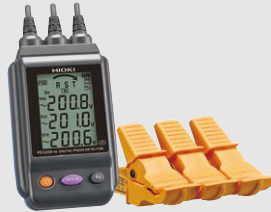
DIGITAL PHASE DETECTOR PD3259-50