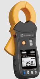
CLAMP ON EARTH TESTER FT6380-50

More compatible HIOKI products and apps are on their way