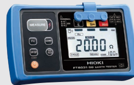
EARTH TESTER FT6031-50