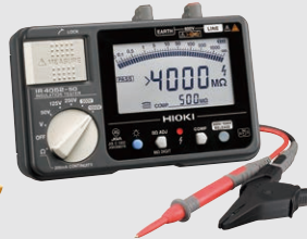
INSULATION TESTER IR4057-50