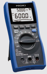
DIGITAL MULTI METER DT4261