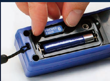
Easy set up