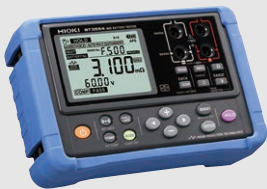
BATTERY TESTER BT3554-50