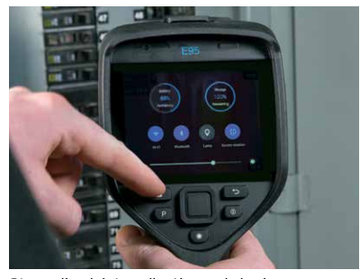
Streamlined data collection and sharing speeds analysis and repairs