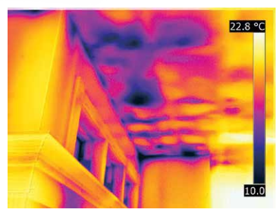
Quickly detect moisture intrusion and building deficiencies