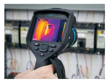
One-handed operation with convenient buttons helps maintain workplace safety