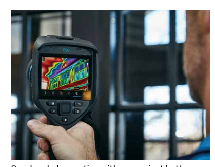
One-handed operation with convenient buttons for safe, streamlined use