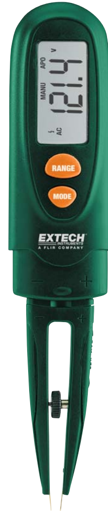
Take voltage measurements using the attachable test lead tip (RC200-TL)