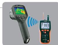
Wireless METERLiNK™ Communication via Bluetooth®