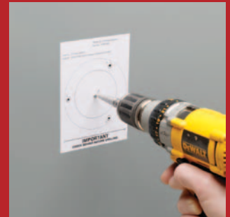
Position with template