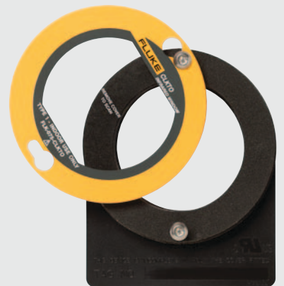
Fluke CLKTO IR Window for indoor medium voltage applications up to 38 kV