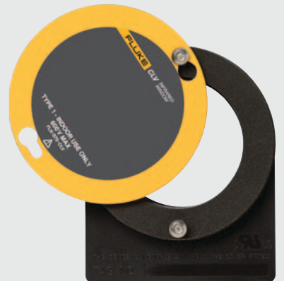
Fluke CLV IR Window for indoor low voltage applications up to 600 V