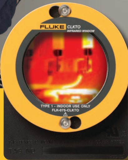
Indoor medium voltage