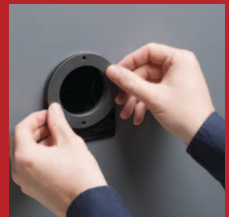
Affix the window

For detailed installation see the UL validated installation instructions supplied