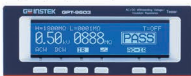
Large LCD, High Intensity Indicators and Function Keys

The 240 x 48 display clearly shows the applied voltage, test parameters, test conditions, measurement value and result on the screen at the same time. The real-time status update on the LCD display accompanied by the multi-colored LED status indicators on the front panel allow operators to have a full control of the test process to perform precision test and avoid unnecessary operation risks at the same time. The status indicator above the high voltage output terminal will automatically flash when an output is in place. In addition, the function keys arranged below the LCD display provide convenient operation that test functions can be easily changed by a single pressing.