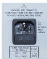
Universal Input Voltage Range

Additionally, the GPT-9600 series provides the universal input voltage range for operating equipment in countries with different electrical power standards. With the GPT-9600 series, the hustle of switching or selecting input voltage range can be left behind. Furthermore, 50Hz or 60Hz can be selected to provide a stable and appropriate test voltage without relying on the electrical environment conditions of input power so as to meet the test requirements.