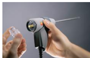
Stable probes filter particles before they get into gas paths