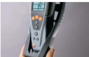
The "second skin" is integrated into the instrument design and protects from impact and shock during tough everyday use