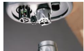
Fast probe connection: All gas paths are connected with one "click"