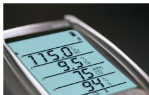
Excellent display clearness even in unfavourable lighting conditions