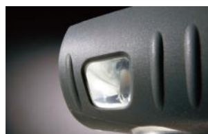
Built-in condensate trap