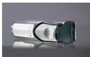
Latest Li-ion rechargeable batteries