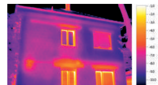
Thermal image with ScaleAssist