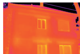
Thermal image without ScaleAssist

Since the temperature scale and coloring of thermal images can be adapted individually, it is possible that the thermal behavior of a building, for example, can be wrongly interpreted. The testo ScaleAssist function solves this problem by adjusting the color distribution of the scale to the interior and exterior temperature of the measurement object and the difference between them. This ensures objectively comparable and error-free thermal images.