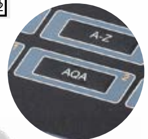
Direct access to AQA functions