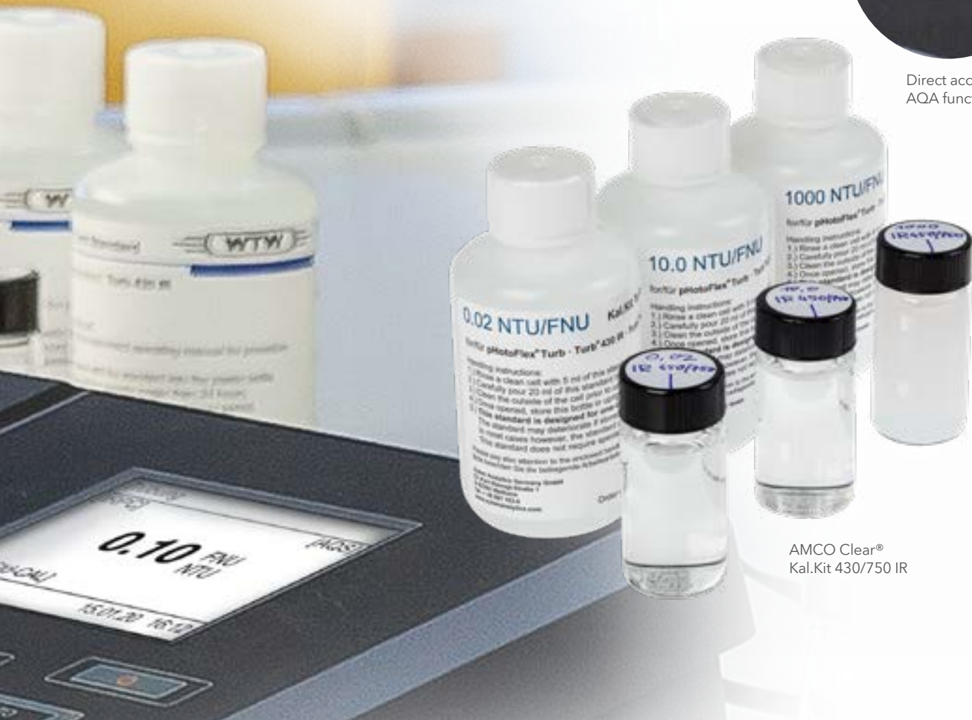
AMCO Clear® Kal.Kit 430/750 IR